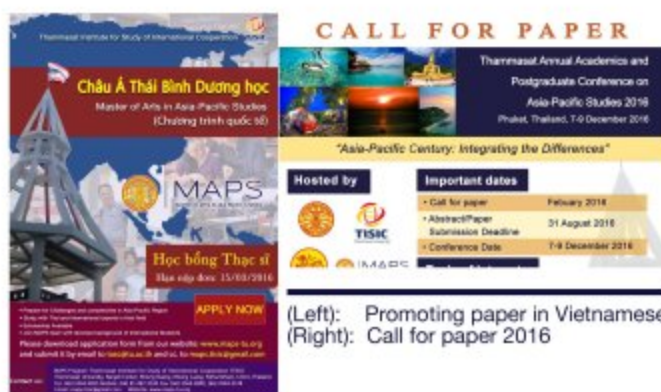
(Left): Promoting paper in Vietnamese (Right): Call for paper 2016

Also at the end of the year, MAPS plan for the 1st Post-Graduate International Conference in Phuket. The 2-day international conference will welcome scholars in the field of Asia-Pacific studies, public policies, international relations, political sciences, economics, laws, and telecommunication policy. Our first batch of MAPS will present the fruit of their labor at the very first showcase of the program and be scrutinized by the renowned scholars in the fields including scholars from Japan, South Korea, Australia, Europe, United States, and ASEAN.